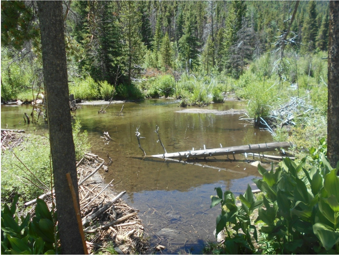
Figure 4. Beaver Pond on Green's Creek