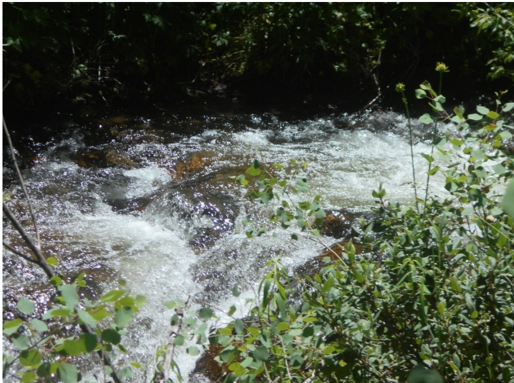
Figure 3. Cascading water in Green's Creek