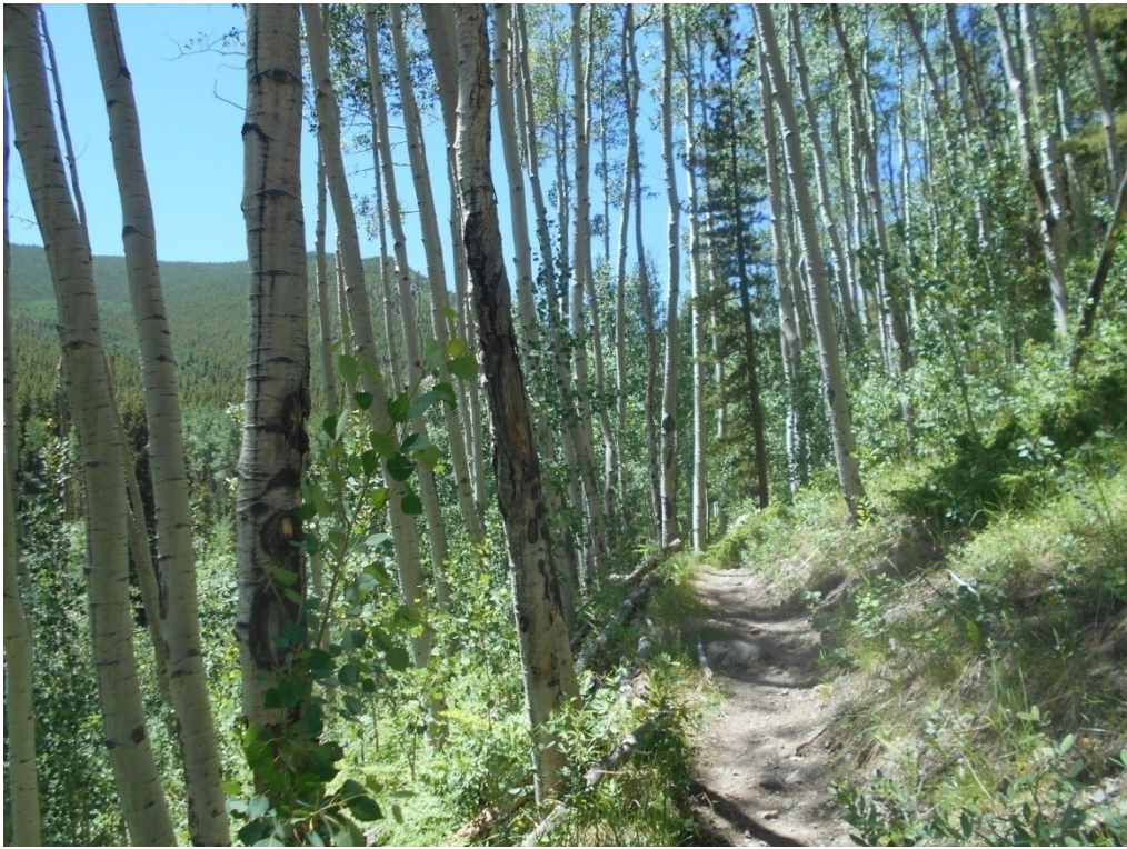
Figure 2. Aspens along trail